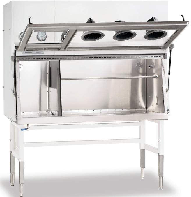
A viewscreen top hinge allows full opening for loading of instrumentation or equipment.