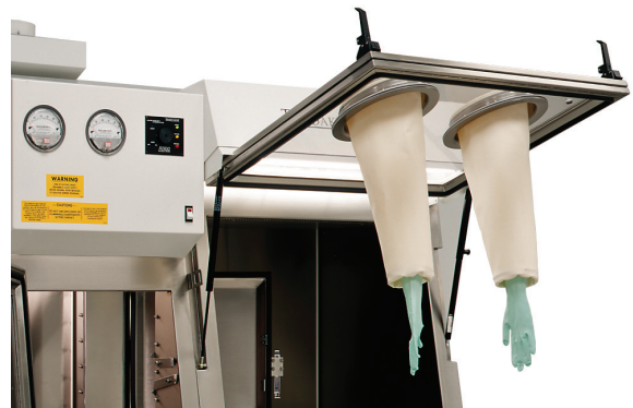
A viewscreen top hinge allows full opening for loading instruments or equipment. The viewscreen is locked to prevent unauthorized opening.